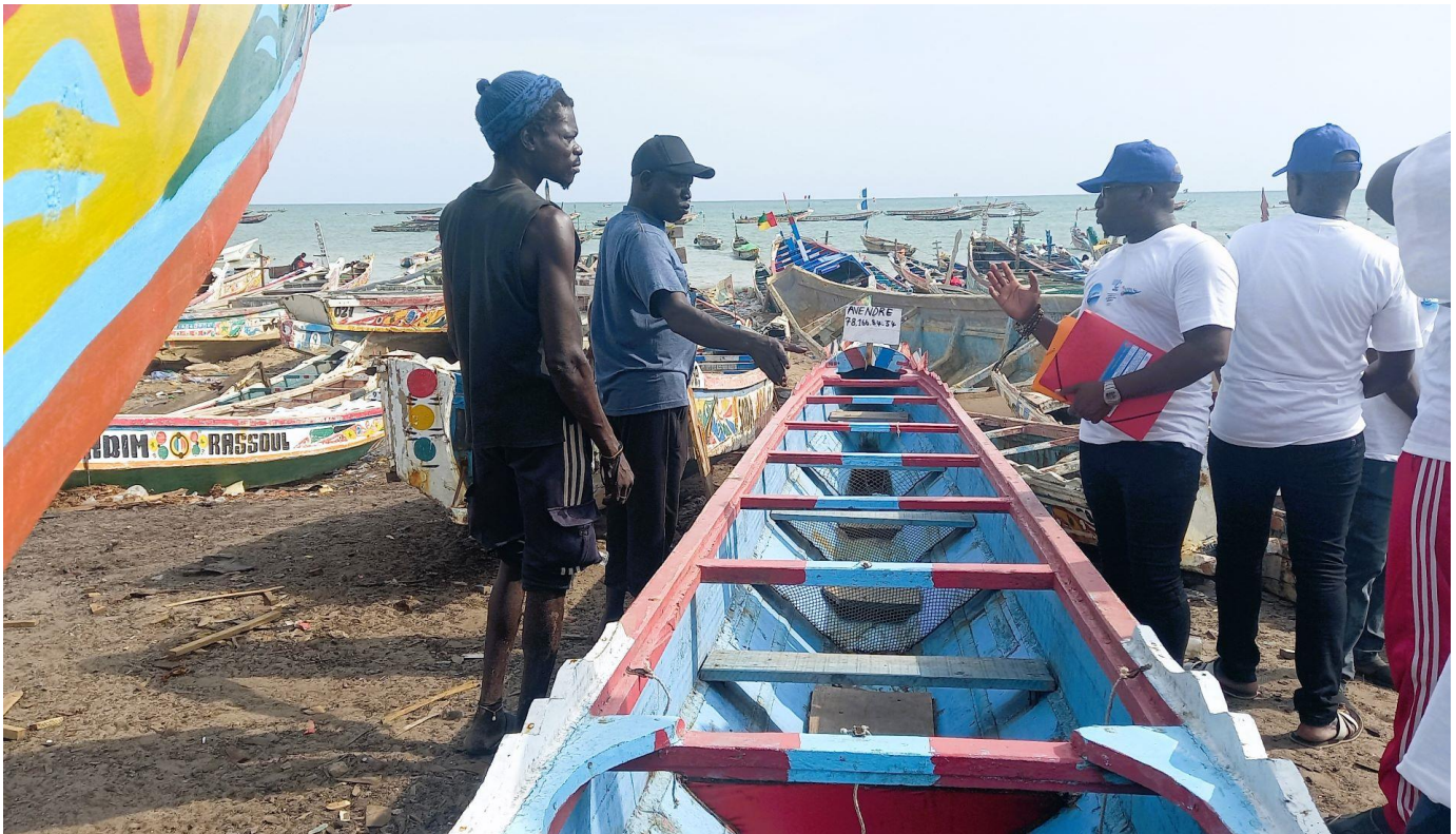
Small-scale fishing canoe for sale at the Mbour fishing dock